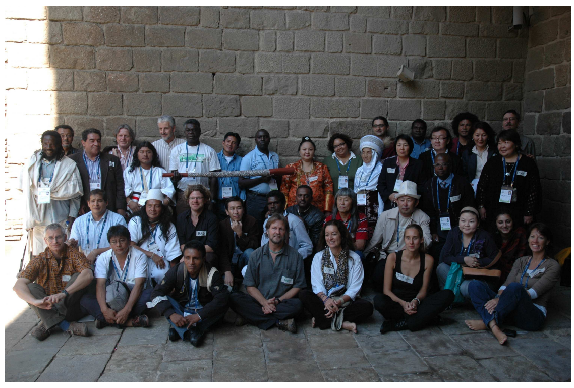
Gathering of sacred natural sites custodians, supporters and conservation biologists during a dialogue at the IUCN World Conservation Congress, Barcelona October 2008.