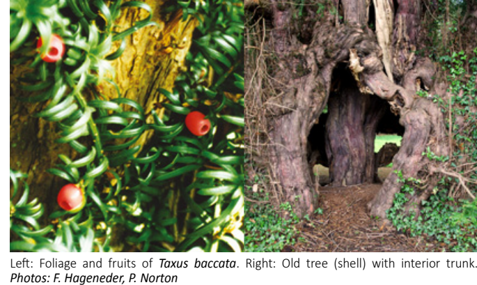
It is an archaic tree with unique survival strategies. Among them are the ability to germinate and grow

Yew occurs naturally all around the northern hemisphere as scattered individuals or in groups in temperate forests, but in avoidance of hot, dry summers and cold winters it sticks to the maritime regions. Yew is the oldest native tree species of Europe, the genus goes back 15 million years, the predecessors date back to the Jurassic period.