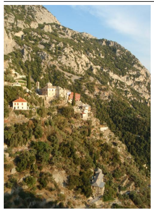
Panorthodox Aghia Anna Skete. Monastic settlements and garden terraces on steep slopes within the off-road area of the Athonite Peninsula, Greece. All transportation, including solar panels, is done with mules

provides a representative sample and a few outstanding examples are discussed below.