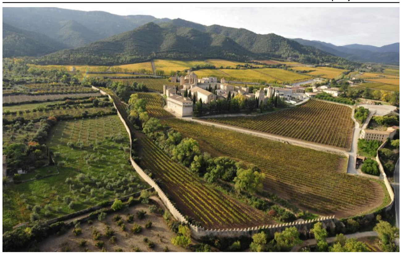
Santa Maria de Poblet, a Cistertian monastery, Catalonia, Spain. Within the walls, vegetable gardens and orchards for the community. Around, vineyards, olive and almond groves. At the background, forested slopes managed by the monks for seven centuries

In just a few decades, many monastic forests that had been carefully managed for centuries were cut down or seriously damaged (Urteaga, 1989). Numerous traditional varieties of fruit and vegetables were lost and a great deal of traditional ecological knowledge, including many of the best practices that had been gradually developed over centuries by monastic orders in Europe, was rapidly forgotten. Later, when political situations changed and a certain level of tolerance reemerged, a monastic resurgence occurred in many European countries, which led to the partial recovery of what had been lost, including natural resources and quality landscape management.