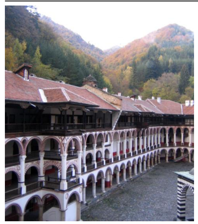
Partial view of the Rila monastery, Bulgaria, surrounded by magnificent forests. The community has kept the 'holy unity' with nature that the founder, St Ivan Rilski, wished eight centuries ago.