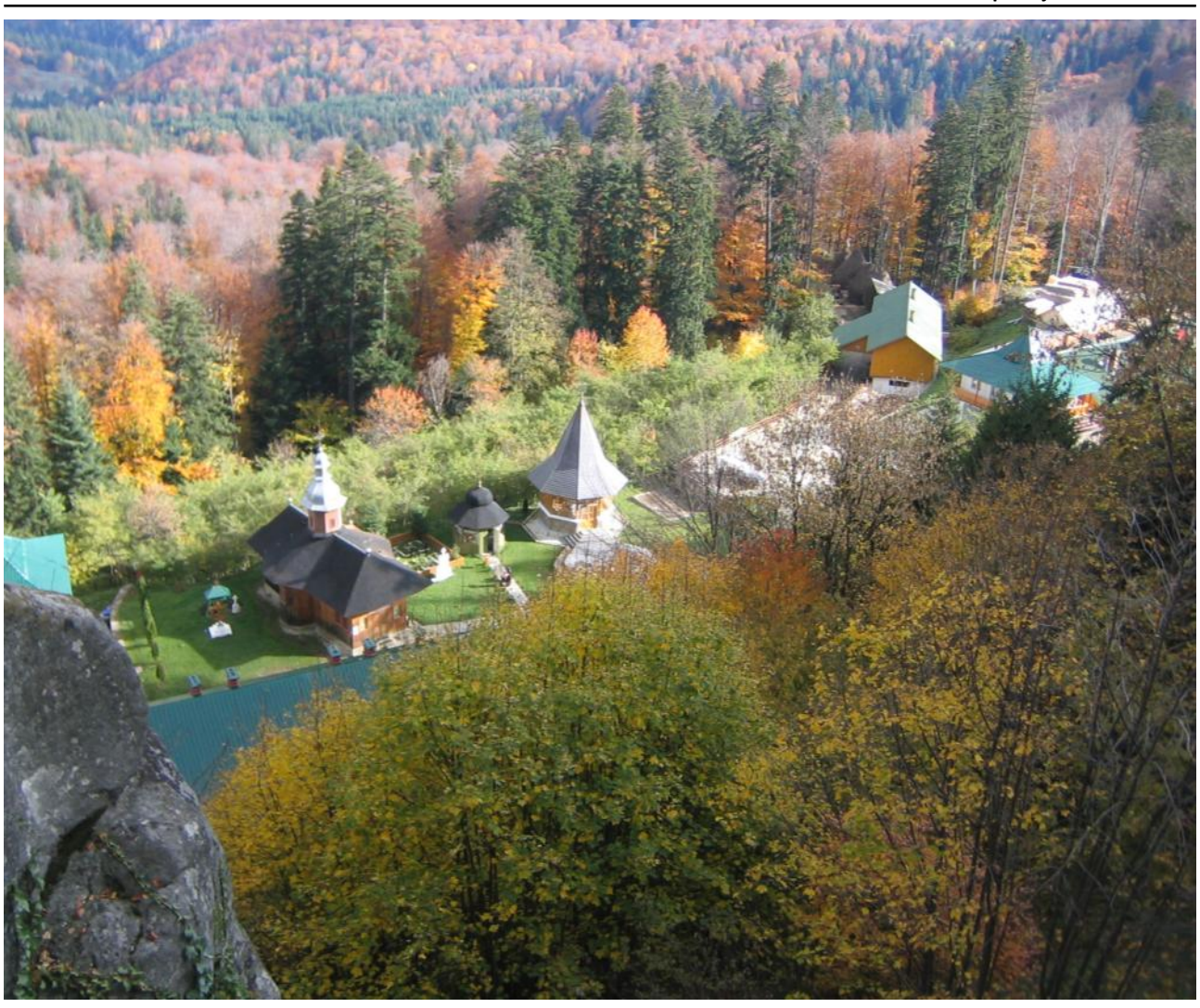
New Skete of Sihla, Moldavia, Romania, is a good example of the new orthodox monastic settlements in the Carpathians, within the Natural Park of Vanatori Neamt

the terms 'holy' or 'sacred' to refer to their territories. As these communities normally intend 'to endure for ever' in the same place, natural resources are carefully safeguarded not just for the present generation, but to be bestowed on future generations of monks or nuns. Among the most cherished values stemming from this philosophy are silence, solitude, harmony and beauty, which they consider as prerequisites for experiencing a sacred atmosphere (Mallarach & Papayannis, 2007). Here one finds all the criteria suggested by E. F. Schumacher to ensure the conservation of the intrinsic value of the land, namely health, beauty and permanence (Schumacher, 1997).