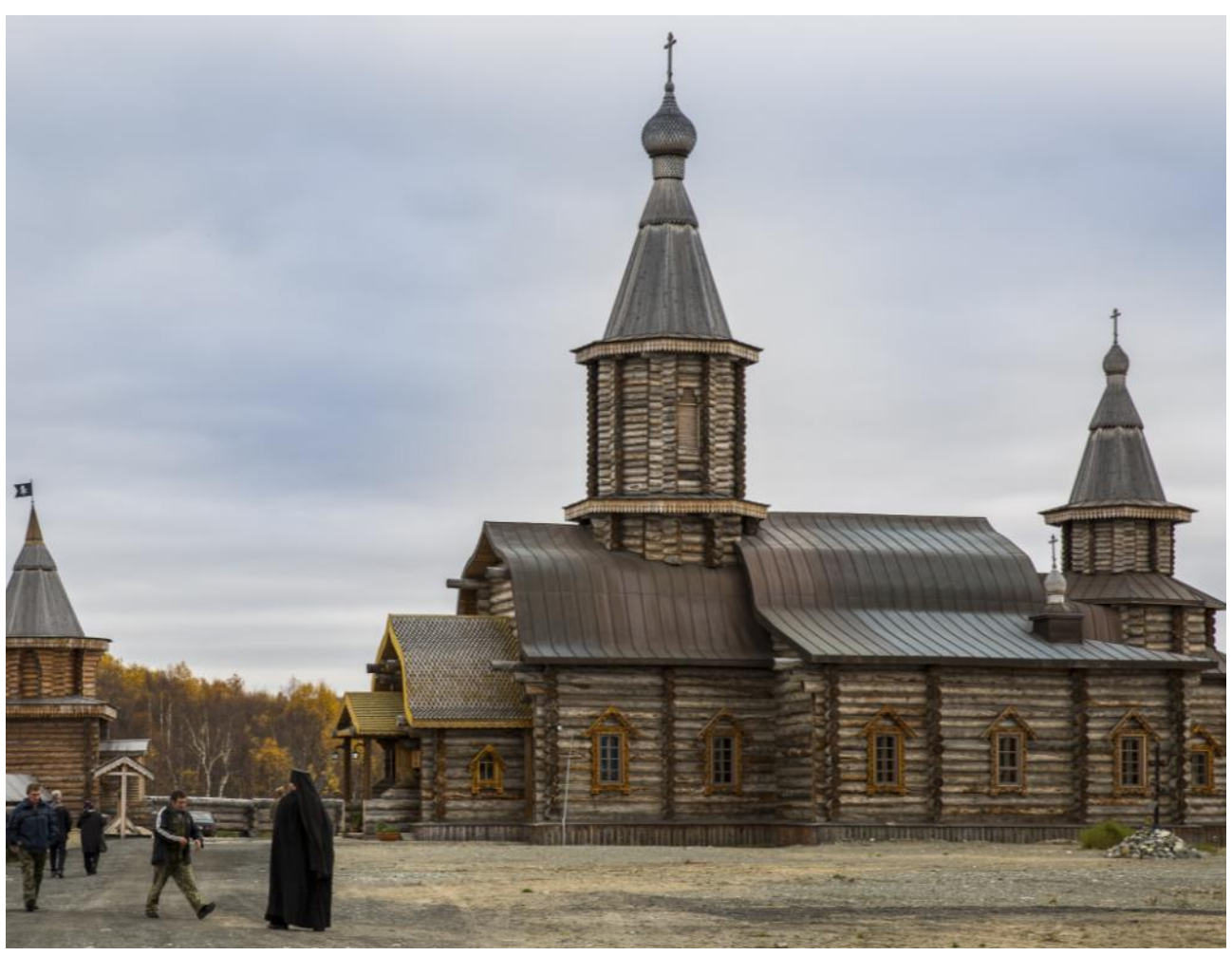
The Orthodox Monastery of Pechenga Russian Federation is thriving in the extreme conditions of the Kola peninsula

and Hauterive (Switzerland), Cystersów (Poland) and many more in Romania. A number of monastic communities such as Randol, Chambarand and Lérins (France) that raise cattle or sheep, produce organic cheese for self-consumption and/or for sale.